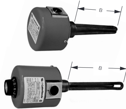
Table 1 – Screwplug Heaters (One Element) - 1" NPT